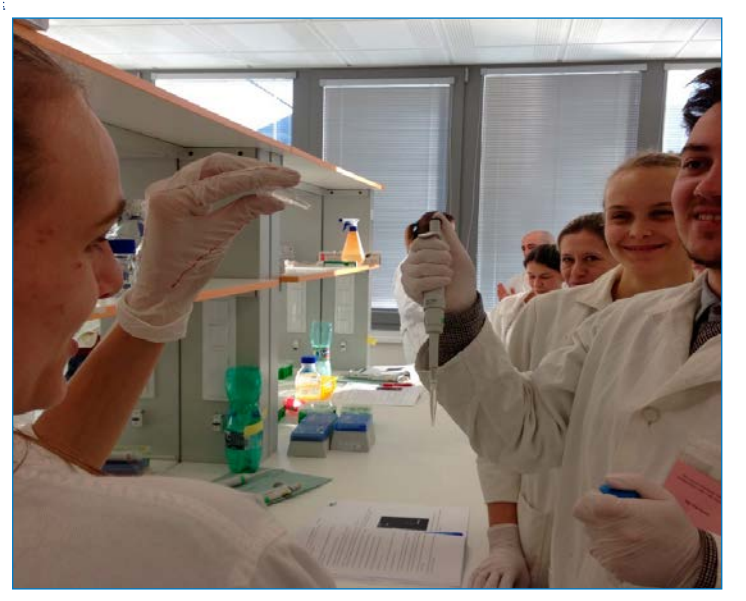
Isolation of genomic DNA