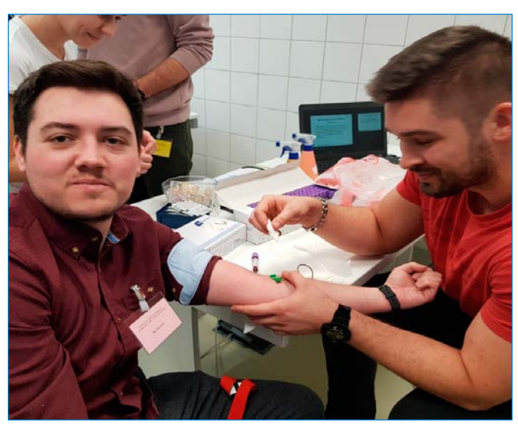
Peripheral Blood collection

The "lab in a suitcase" was completed/extended with the help of faithful sponsors of the programme and generous funding from the IFCC. More specifically, the basic equipment and reagents used in the practical course were provided by Biorad , Eppendorf , and the Lesser-Loewe Foundation . Roche Diagnostics Greece provided the CMV kit and all necessary reagents used for the the real time quantitative PCR experiment.