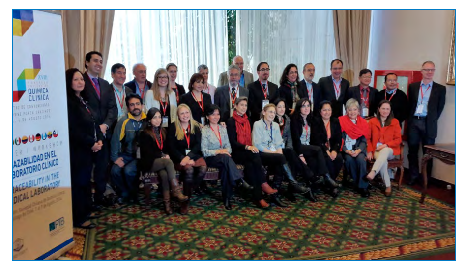
Santiago de Chile meeting with the participation of professional societies, accreditation bodies and metrology institutes, 4-6 August, 2014