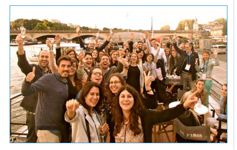
IFCC-TF-YS Evening Cruise – 23 June 2015

We are thankful to all our young colleagues for their presence and debate on such important topics and to