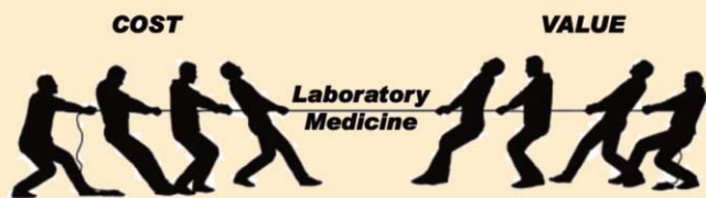
FIGURE 1. Laboratory medicine, between costs and value.

So, what does the future hold for laboratory medicine? In a world with limited resources, just now recovering from an unprecedented economic crisis, which has profoundly impacted the budgets of many healthcare services worldwide, there are two leading paradigms for reaffirming the real value, along with the sustainability, of laboratory diagnostics. The former and rather predictable solution entails focusing more on appropriateness. Several lines of evidence attest that inappropriate testing (both under- and over-use) is still high in routine practice, often exceeding 60-70% of all requests. The large amount of money wasted for avoidable tests may hence be seen as a precious treasure to recover for implementing innovative tests, so moving forward or fostering personalized care (2). The second solution encompasses enhancing the visibility of IVD as a medical discipline and as a profession, emphasizing the crucial role of laboratory testing in several care pathways. It should be firmly